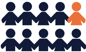
POPULATION LIVING BELOW FEDERAL POVERTY LEVEL BY RACE & ETHNICITY

$21,960 Poverty Guideline for 3-Person Household